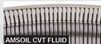
AMSOIL CVT FLUID