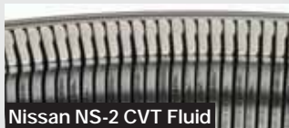
Nissan NS-2 CVT Fluid