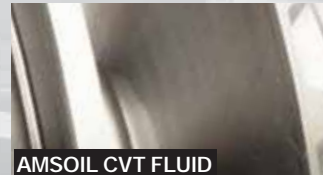
AMSOIL CVT FLUID

Order by Phone 1-800-956-5695 - Give Operator Reference #1730877